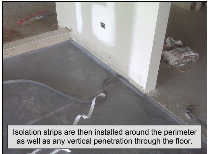
Isolation strips are then installed around the perimeter as well as any vertical penetration through the floor.