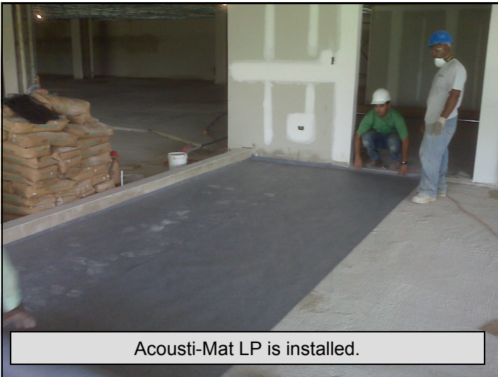
Acousti-Mat LP is installed.

To provide a quiet separation between the courtroom and the court's library, Acousti-Mat LP was laid and then topped with Dura-Cap. The building now has a smooth hard floor and a permanent sound control system - even if floor goods are changed in the future.