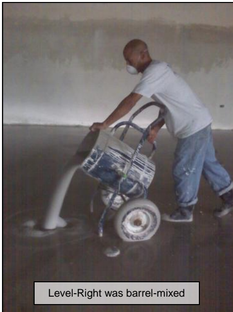
Level-Right was barrel-mixed

This four story children's hospital utilized Maxxon Level-Right® to provide flat and level floors for sheet vinyl and epoxy terrazzo. The vinyl installer was skeptical initially until he saw the finish the next day.