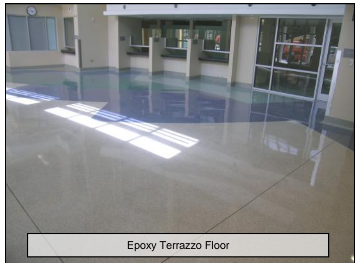
Epoxy Terrazzo Floor